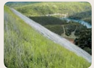
Mine Project: Northern California