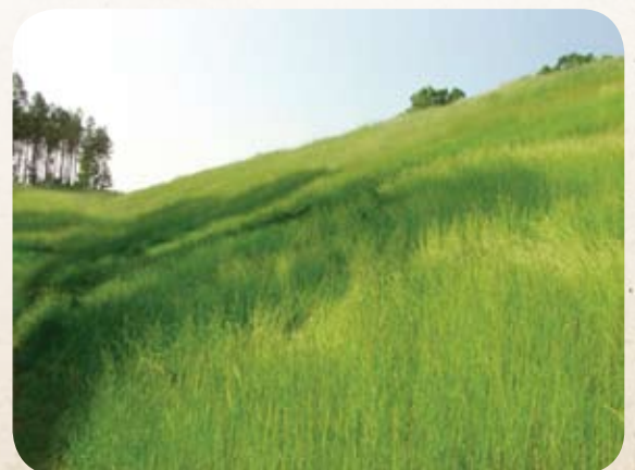
Application and Rapid Results: Highway Project

The result of Green Design Engineering is sustainable erosion control, even under harsh soil conditions and on severe slopes and channels. This serves as added peace of mind that every site keeps soil and sediment in place—while restoring or creating a natural landscape that's more aesthetically pleasing and more ecologically productive. Through Green Design Engineering, Profile is the industry's true 'green' solutions provider, delivering first-time, cost-effective and long-term success.