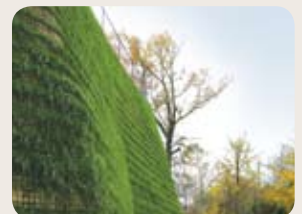
Mechanically Stabilized Earthen (MSE) Wall: Raleigh, NC