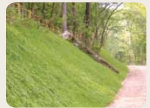
Residential Construction: Bella Vista, AR

Profile utilizes Green Design Engineering™ to provide reliable, sustainable solutions for an expanding range of sites, including slopes, channels, shorelines, water management projects, waste containment sites, fine turf areas and other environmentally sensitive sites. In fact, Green Design Engineering has taken erosion control to a whole new level. Reinforced vegetation can now handle nearly 3 times the velocity and up to 5 times the shear stresses of natural turf—sites that were once the sole domain of hard armor.